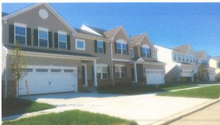
Exterior of homes